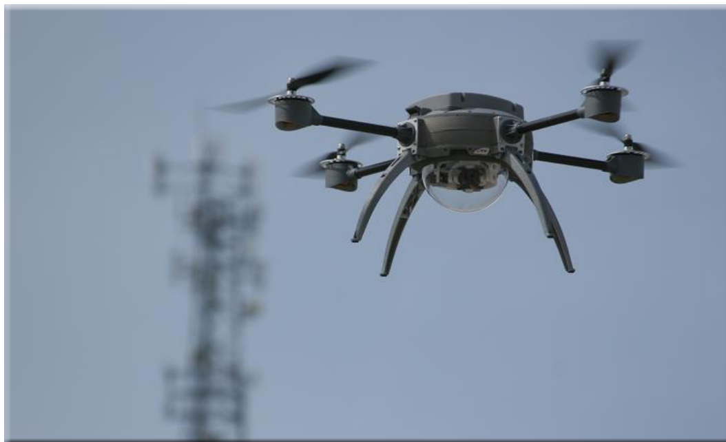
Aeryon Scout in flight.