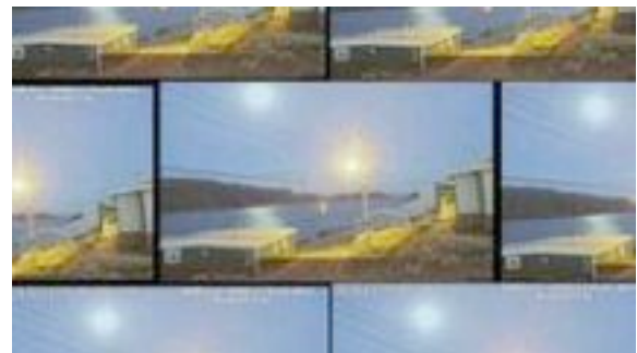
CSIEL Art Exhibit image