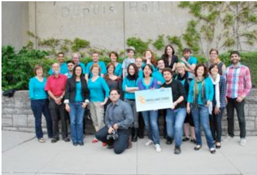
Participants in SSSS 2011